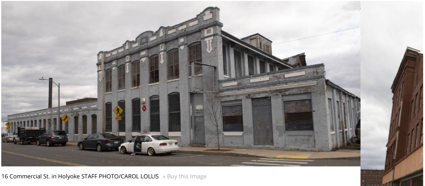
16 Commercial St. in Holyoke » Buy this Image